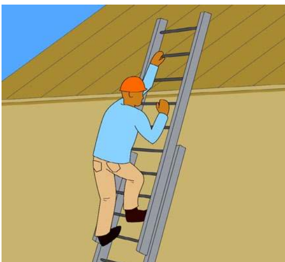
Figure 2: Ladder extending three feet above the landing area.